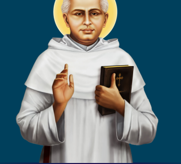
St. Kuriakose Elias Chavara 1805 - 1871 Founder - CMI Congregation